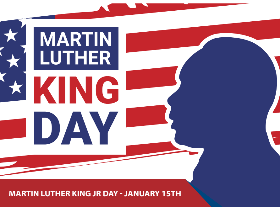
MARTIN LUTHER KING JR DAY - JANUARY 15TH