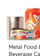
Metal Food & Beverage Cans